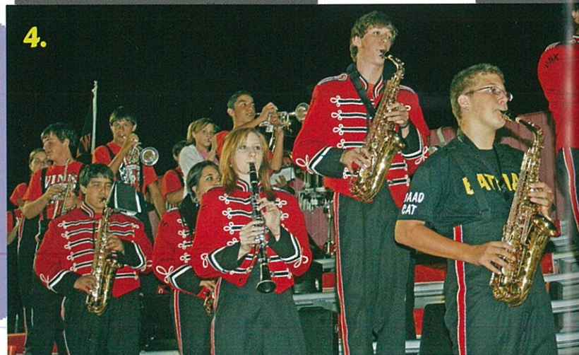
4. The Baad Cat Band supports the football team during a timeout.